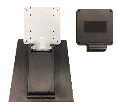
2) Remove the black VESA cover.