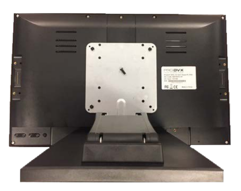
3) Place the ProDVX screen with the display facing the desk and lay the DS-100 Desk Stand on top of the VESA holes on the backside of the display and mount the VESA by using the 4 long VESA screws, until you feel resistance.